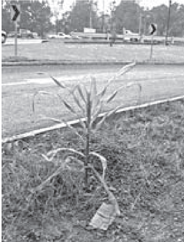
Figure 1. A maize plant growing on the side of the highway outside Guadalajara, Mexico. This plant presumably arrived as a seed fallen from a transport truck.

dispersal of seeds themselves can also be an agent of gene flow. The movement of seeds can occur in a range of ways, mostly by human activities, such as transportation (Figure 1), or by wind or wild animals.